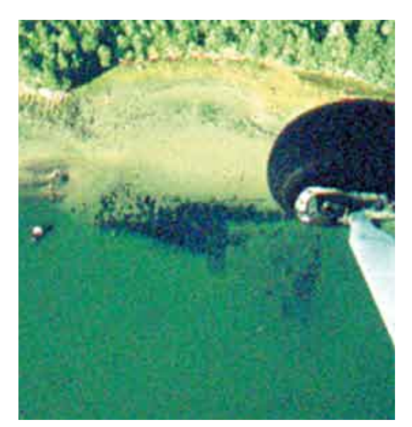
Restored Zostera marina bed from the air, New Hampshire, USA.

Site selection that favours seagrass growth is important (see Fact Box 9, see also Short et al. 2002a and Short and Burdick 2005 for quantitative site selection models). While collecting planting stocks (mature shoots or seeds), care must be taken to minimise damage of the donor meadows. Transplantation is labour intensive because it requires the painstaking harvest of shoots followed by hand or frame transplanting, limiting it applicability for large areas.