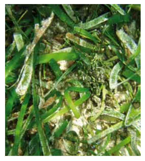
Six seagrass species can be found in this photo taken in Palau: Enhalus acoroides, Cymodocea rotundata, Cymodocea serrulata, Thalassia hemprichii, Syringodium isoetifolium, and Halodule uninervis.

Some seagrasses acclimate to changing environmental conditions better than others. Intra-meadow genetic diversity has been shown to be a key factor supporting the resilience of Zostera marina , and efforts should be devoted to investigating such mechanisms in other key seagrasses.