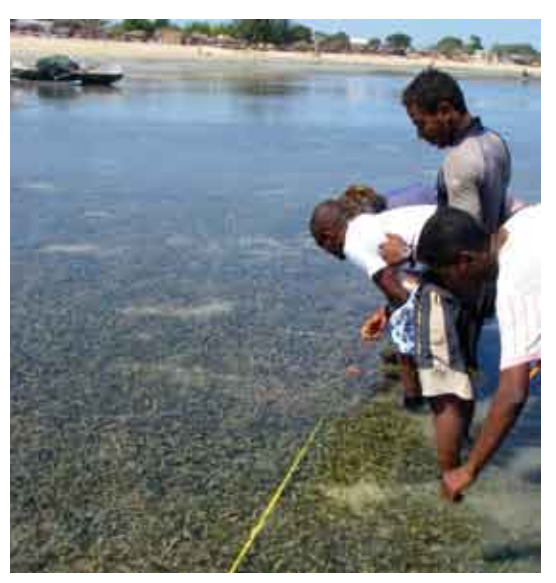
Sampling an intertidal seagrass meadow in Ifaty, Madagascar.

Restoration strategies may help seagrasses to cope with climate change and other anthropogenic impacts and introducing founder populations can speed up ecosystem recovery following a disturbance (Orth et al. 2006b). For example, Halodule wrightii is a pioneering species and has been planted as a habitat stabiliser prior to transplanting Thalassia testudinum and other seagrasses in restoration efforts (Durako et al. 1992, Fonseca et al. 1998).