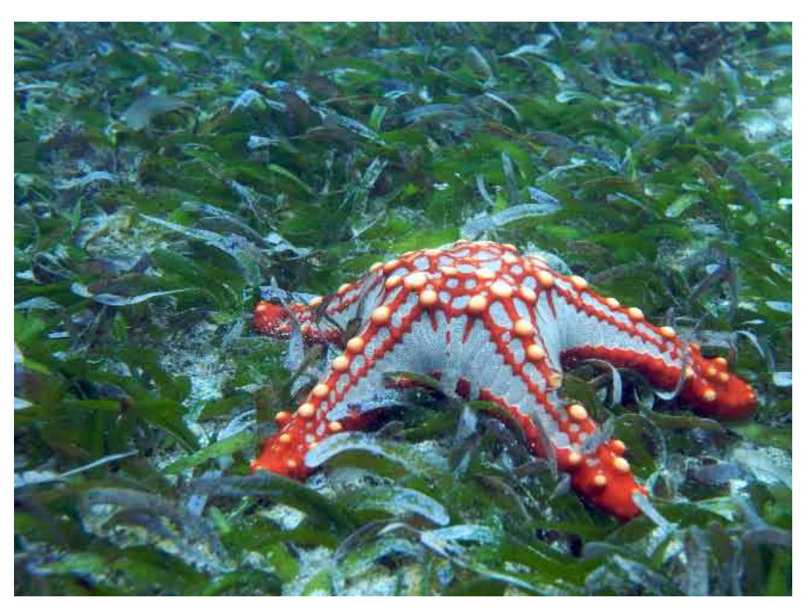
The sea star Protoreaster linckii on the seagrass Thalassia hemprichii on an intertidal reef flat, Tanga, Tanzania.

There is growing evidence that seagrasses are experiencing declines globally due to anthropogenic threats (Short and Wyllie-Echeverria 1996, Duarte 2002, Orth et al. 2006). Runoff of nutrients and sediments that affect water quality is the greatest anthropogenic threat to seagrass meadows, although other stressors include aquaculture, pollution, boating, construction, dredging and landfill activities, and destructive fishing practices. Natural disturbances such as storms and floods can also cause adverse effects. Potential threats from climate change include rising sea levels, changing tidal regimes, UV radiation damage, sediment hypoxia and anoxia, increases in sea tempera-