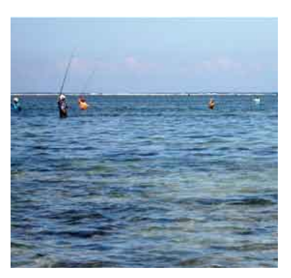
Fishermen in seagrass, Bali, Indonesia.

Seagrasses have had many traditional uses (cf. Terrados and Borum, 2004). They have been used for filling mattresses (with the thought that they attract fewer lice and mites than hay or other terrestrial mattress fillings), roof covering, house insulation and garden fertilisers (after excess salts were washed off). They have also been used in traditional medicine in the Mediterranean (against skin diseases) and in Africa (Torre-Castro and Rönnbäck 2004). Seagrass seeds of several species are sometimes used as a food source.