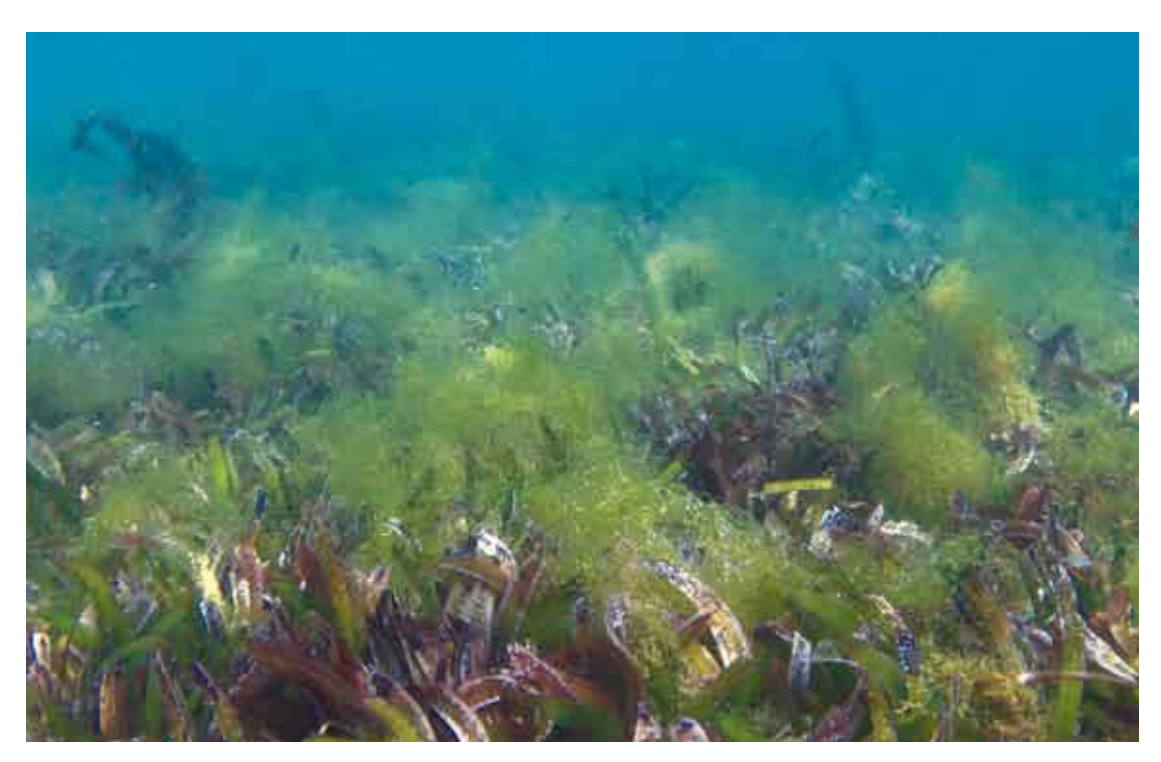
Seagrass bed, Thalassia hemprichii, covered with green algae, Tanga, Tanzania. Fast-growing algae can smother seagrasses as well as corals.

Human development can alter coastal ecology, often resulting in loss of seagrass habitats. Extensive losses, especially in developed and densely populated areas have been documented. An estimated 65% of Zostera marina in industrial parts of the northwest Atlantic was lost since the time of European settlement (Short and Short 2003). In other examples, 5000 hectares of seagrass meadows disappeared during the development of the rural area of Adelaide, Australia (Westphalen et al. 2004) and 58% was lost along the Swedish west coast over the last two decades (Baden et al. 2003).