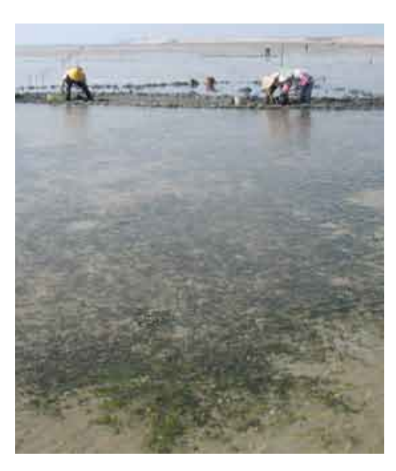
Fishers harvesting clams from an aquaculture lease in a seagrass bed (Zostera japonica and Halophila ovalis) in Bei Hai, China.

pH : Concomitantly with increased dissolved CO<sub>2</sub> levels, the pH of oceanic waters will decrease. This is because CO<sub>2</sub> in solution forms an equilibrium with carbonic acid, which dissociates to add