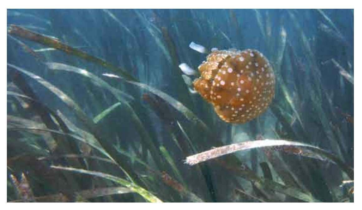
Jellyfish over Enhalus acoroides meadow, inner near-shore, Tanga, Tanzania.

Seagrasses are experiencing a worldwide decline due to a combination of climate change impacts and other anthropogenic factors. Seagrass areas along coastlines that are already affected by human activities (causing e.g. sedimentation, nutrient enrichment, eutrophication and other environmental destruction) are most vulnerable to climate change impacts. Mitigating strategies (e.g. limiting greenhouse gas emissions) that affect the rate and extent of climate change impacts should be coupled with resilience-building adaptation strategies (Johnson and Marshall 2007). Managers can promote policies that protect and conserve seagrasses, while also assisting in mitigation efforts by raising awareness about the vulnerability of seagrass habitats to coastal impacts. Managers can also contribute knowledge about climate change impacts on tropical and temperate marine ecosystems to help set mitigation targets (Johnson and Marshall 2007).