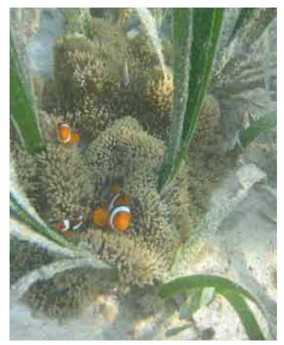
Seagrass, Enhalus acoroides, with sea anemone and clown fish, Indonesia.

Areas where seagrass beds are proven as beneficial to adjacent ecosystems like coral reefs and mangroves should definitely be granted protection. Mangroves, reefs and seagrasses often have a synergistic relationship, based on connectivity, which exerts a stabilising effect on the environment. Seagrasses and mangroves stabilise sediments, slow water movements and trap heavy metals and nutrient rich run-off, thus improving the water quality for corals and fish communities. Seagrasses and mangroves filter freshwater discharges from land, maintaining necessary water clarity for coral reef growth. Coral reefs, in turn, buffer ocean currents and waves to create a suitable environment for seagrasses and mangroves. Mangroves also enhance the biomass of coral reef fish species. It has been shown that seagrass meadows are important intermediate nursery habitats between mangroves and reefs that increase young fish survival (Mumby et al. 2004, Unsworth et al. 2008). Protected area managers