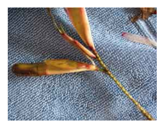
Thalassodendron ciliatum in Mombassa, Kenya: flowering shoot with viviparous seedling.

must in seagrasses support not only their aboveground tissues but also their underground roots and rhizomes (and the latter can have a biomass exceeding that of the shoots). Thus, seagrasses must in principle photosynthesise more than e.g. macroalgae in order to support the growth of the entire plants. On the other hand, the roots of seagrasses aid them in the uptake of nutrients; thus, seagrasses can thrive in nutrient-poor waters provided that the substrate is rich in nutrients. What, then, is the limiting factor for the growth and productivity of seagrasses as based on their photosynthetic rates? Under natural conditions, light, salinity, the inorganic carbon source, nutrient availability and temperature can all limit the growth rates of seagrasses.