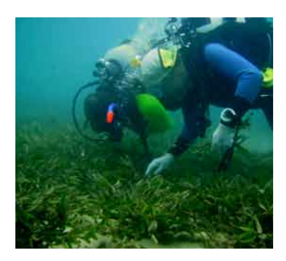
Sampling seagrasses in Madagascar, Thalassodendron ciliatum meadow, Madagascar.

the sediments, which in turn allows nutrients to be efficiently recycled from dead organic matter.