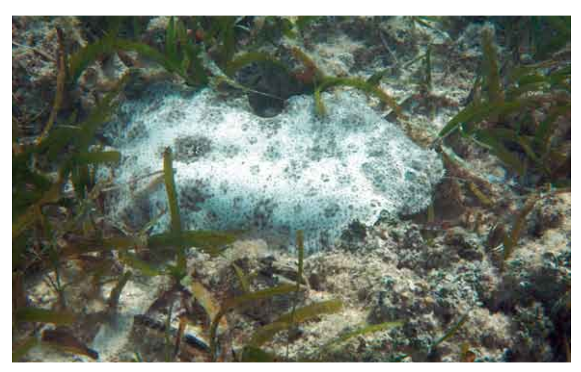
Flatfish in seagrass, Cymodocea rotundata and Thalassia hemprichii, behind the reef flat of a fringing reef of hard substrate mixed with sand, Tanga, Tanzania.

This paper presents an overview of seagrasses, the impacts of climate change and other threats to seagrass habitats, as well as tools and strategies for managers to help support seagrass resilience.