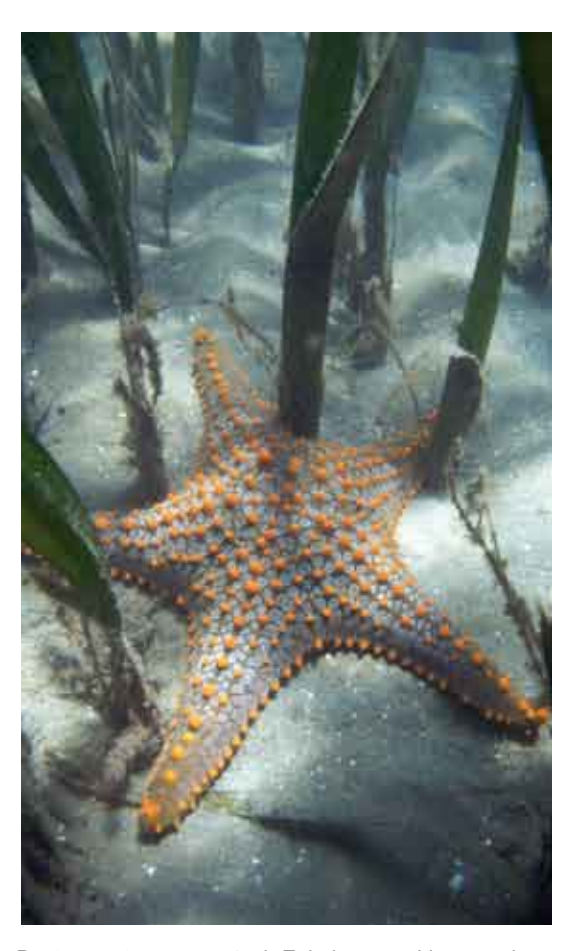
Pentaceraster sp. seastar in Enhalus acoroides meadow, inner near-shore, Tanga, Tanzania.

To effectively reduce the risk of losing seagrasses by climate change impacts and other anthropogenic disturbances, managers should identify and