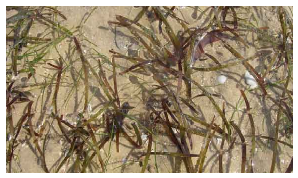
Cymodocea rotondata with red leaves from UV blocking pigments, Hainan Island, China.

pard and Rioja-Nieto 2005). Temperature stress on seagrasses will result in distribution shifts, changes in patterns of sexual reproduction, altered seagrass growth rates, metabolism, and changes in their carbon balance (Short et al. 2001, Short and Neckles 1999). When temperatures reach the upper thermal limit for individual species, the reduced productivity will cause plants to die (Coles et al. 2004). Elevated temperatures may increase the growth of competitive algae and epiphytes, which can overgrow seagrasses and reduce the available sunlight they need to survive. The response of seagrasses to increased water temperatures will depend on the thermal tolerance of the different species and their optimum temperature for photosynthesis, respiration and growth (Neckles and Short 1999). For tropical seagrasses, it was suggested that the photosynthetic mechanism becomes damaged at temperatures of 40-45°C (Campbell et al. 2005). High temperatures have likely caused large scale diebacks of Amphibolis antarctica and Zostera spp. in southern Australia (Seddon et al. 2000). For the temperate Zostera marina, experiments showed that a 5°C increase