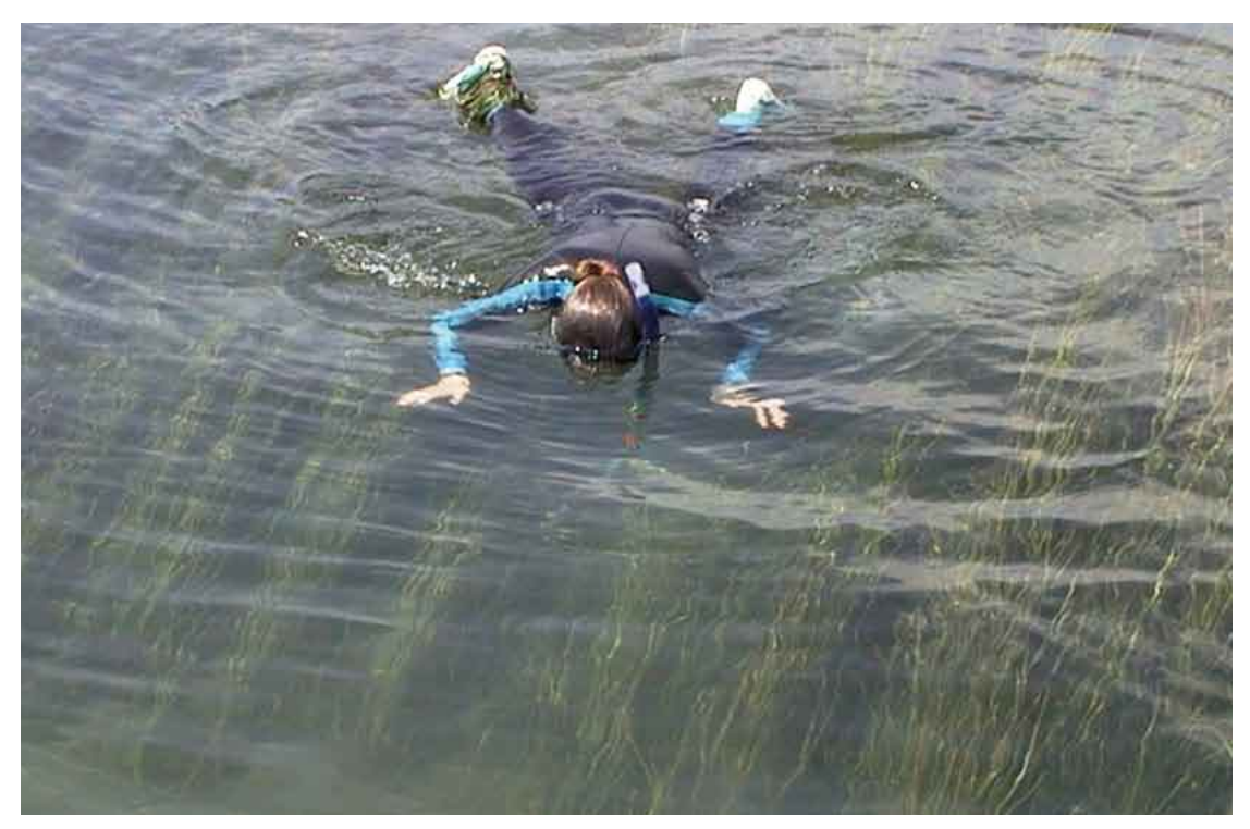
Graduate student snorkeling over a New Hampshire Zostera marina bed.

While only a few larger animals possess the ability to actually digest seagrass leaves (dugongs, turtles, geese, brant, and some herbivorous fish), the leaves often harbour a multitude of organisms such as algae and invertebrates, which serve as food for transient fish, as well as the permanent fauna within the seagrass meadow. Seagrass habitats also provide shelter and attract numerous species of breeding animals. Fish use the seagrass shoots as a protective nursery where they, and their fry, hide from predators. Likewise, commercially important prawns settle in the seagrass meadows at their post-larval stage and remain there until they become adults (Watson et al. 1993). Moreover, adult fish migrate from adjacent habitats, like coral reefs and mangrove areas, to the seagrass meadows to feed on the rich food sources within the seagrass meadows (Unsworth et al. 2008). Many small subsistence fishing practices, such as those in Zanzibar (Tanzania), are totally dependent on seagrass meadows for their fishing grounds (Torre-Castro and Rönnbäck 2004); coastal popu-