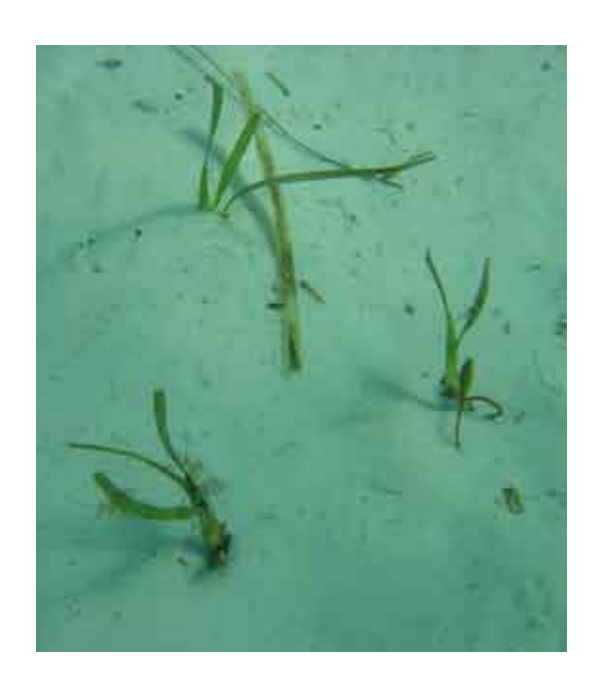
Propagules and seedlings: Posidonia australis in Western Australia.

spp.) to "climax" species that spread slowly and build up large carbon reserves (e.g. Thalassia spp. and Posidonia oceanica ). For Posidonia, extensive rhizome mats, which form under the living meadows, can be over 3000 years old (Mateo et al. 1997).