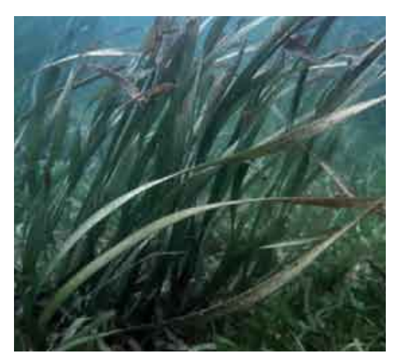
Enhalus acoroides (large) and Thalassia hemprichii (small) in Kosrae, FSM.

cies composition (in mixed meadows). Monitoring of water quality (including light penetration) and sediment composition could be of importance as early warnings of disturbances. Likewise, changes in other biotic factors (e.g. fauna and other plants) may indicate disturbances in the meadows or in the habitats they are connected with.