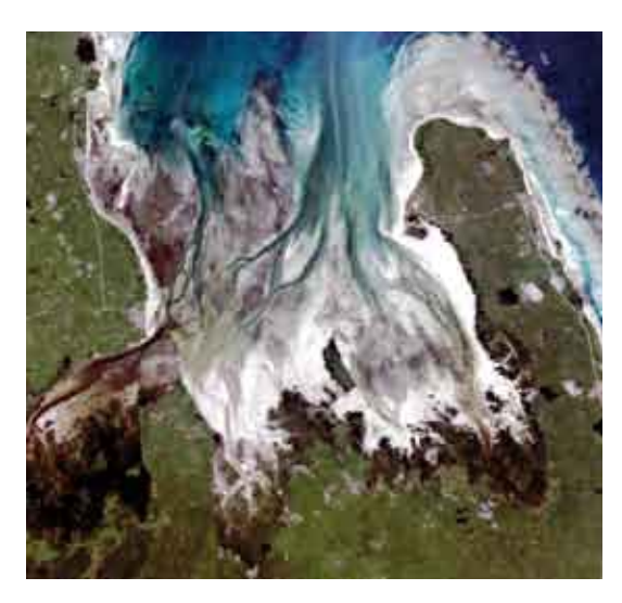
Satellite image of Chwaka Bay, Zanzibar, Tanzania. Source unknown.

seagrass beds (Gullström et al. 2006). It should be remembered that extensive ground-truthing is necessary for verifying all remote mapping data (Duarte and Kirkman 2001).