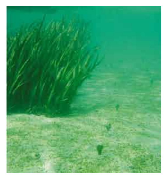
Seagrass diversity: Enhalus acoroides (large) and Halophila ovalis (very small) in Guam.

Sea level rise and altered currents: With future global warming, there may be a 1-5 m rise in the seawater levels by 2100 (taking into account the thermal expansion of ocean water and melting of ocean glaciers, Overpeck et al. 2006, Hansen 2007, Rahmstorf 2007). Rising sea levels may adversely impact seagrass communities due to increases in water depths above present meadows (thereby reducing light), changed currents causing erosion and increased turbidity and seawater intrusions higher up on land or into estuaries and rivers (favouring land-ward seagrass colonisations, Short et al. 2001). Changing current patterns can either erode seagrass beds ("beds" are often used in this text synonymously to "meadows", but may indicate comparatively smaller entities) or create new areas for seagrass colonization. On the positive side, increases in current velocity within limits may cause increases in plant productivity (see Fact Box 9) reflected in leaf biomass, leaf width, and canopy height (Conover 1968; Fonseca and Kenworthy 1987, Short 1987).