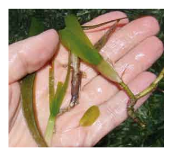
5 seagrass species, left to right: Enhalus acoroides, Cymodocea rotundata, Thalassia hemprichii, Halophila ovalis, and Cymodocea serrulata in Palau.

seagrass shoots vary from long, thin or strap-like leaf blades (up to 3 m long) to small, rounded paddle-shaped leaves (less than 1 cm long). The vegetative growth patterns of lateral branching and new shoot production often create dense meadows that form a canopy over the marine sediment. The plants' structure, as well as the height of the canopy and the extent of the