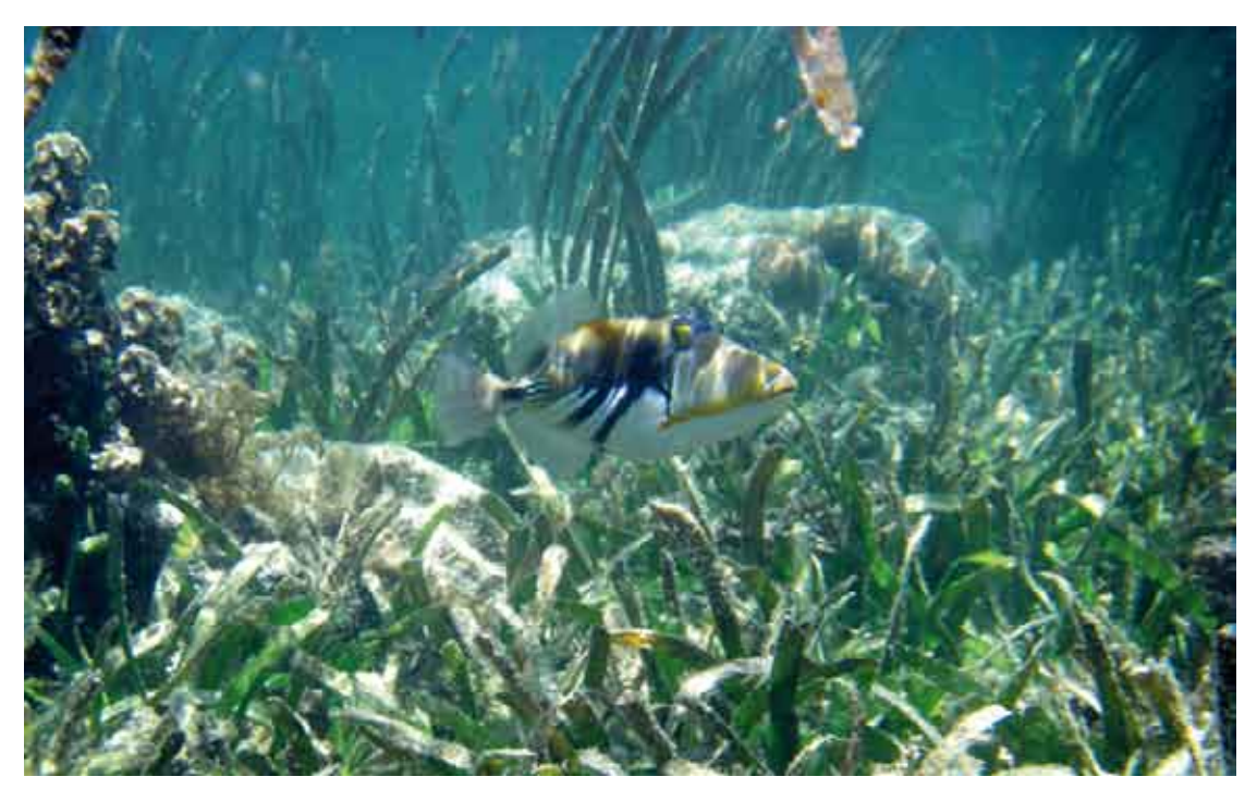
Thalassia hemprichii with Enhalus acoroides in the background, Kosrae, Federated States of Micronesia.

Seagrasses are submerged marine flowering plants forming extensive meadows in many shallow coastal waters worldwide. The leafy shoots of these highly productive plants provide food and shelter for many animals (including commercially important species, e.g. prawns), and their roots and rhizomes are important for oxygenating and stabilising bottom sediments and preventing erosion. The monetary value of seagrass meadows has been estimated at up to $19,000 per hectare per year, thus being one of the highest valued ecosystems on earth.