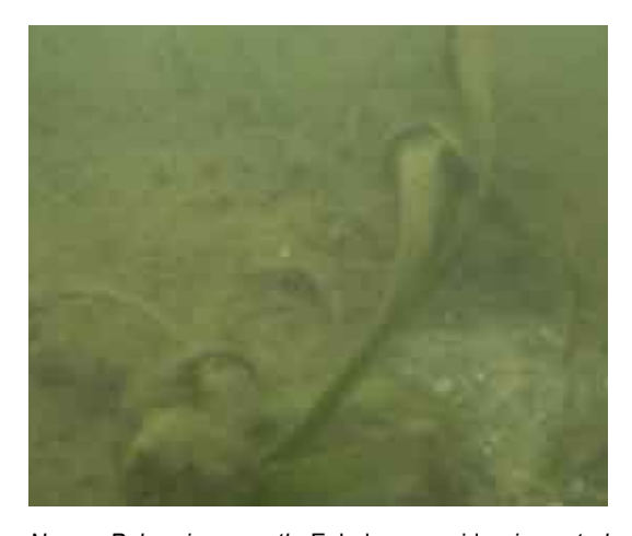
Near a Palau river mouth, Enhalus acoroides is coated with sediment after a heavy rain storm event.

in the normal seawater temperature caused a significant loss in shoot density; however, it seemed that a high genetic diversity within the meadows increased its possibility to recover from such extreme temperatures (Reusch et al. 2005, Ehlers et al. 2008). At the margins of temperate and tropical bioregions (Short et al. 2007), and within tidally restricted embayments where plants are growing at their physiological limits, increased temperature will result in losses of seagrasses and/or shifts in species composition. Seagrass distribution and abundance may also be altered through the effects of increased temperature on flowering and seed germination (de Cock 1981, McMillan 1982, Phillips et al. 1983, Durako and Moffler 1987).