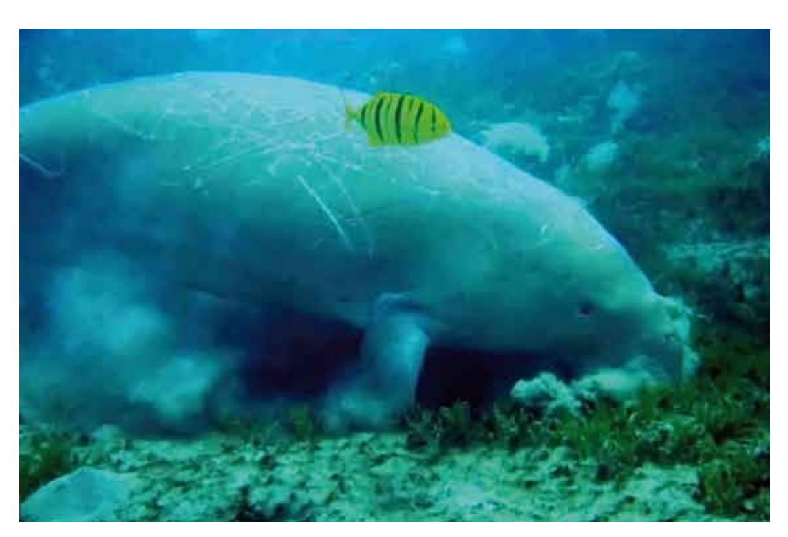
Dugong in seagrass: Halophila stipulacea bed, Red Sea, Egypt

reefs, while in the tropics critical links are with mangrove forests and coral reefs. Seagrasses provide habitats for rich faunal assemblages and seagrass meadows are recruitment and nursery areas for fish and crustaceans (Green and Short 2003). The "seagrass fauna" includes animals at many trophic levels, the most visible herbivores being dugongs, manatees and sea turtles in tropical, and swans and geese in temperate, waters. Seagrasses are also a direct food source for sea urchins and many species of fish (Pollard 1984, Heck and Valentine 1995). However, beyond direct consumption, seagrasses provide crucial food web resources for animals and for people. Particularly important are subsistence gleaning for protein on tropical coasts by villagers, nursery resources for commercially important finfish and shellfish species, and habitats for commercial and recreational bivalve fisheries.